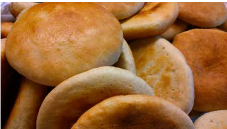
Shared bread.

Then Jesus directed them to have all the people sit down in groups on the green grass. So they sat down in groups of hundreds and fifties. Taking the five loaves and the two fish and looking up to heaven, he gave thanks and broke the loaves. Then he gave them to his disciples to distribute to the people. He also divided the two fish among them all. They all ate and were satisfied, and the disciples picked up twelve basketfuls of broken pieces of bread and fish. The number of the men who had eaten was five thousand.