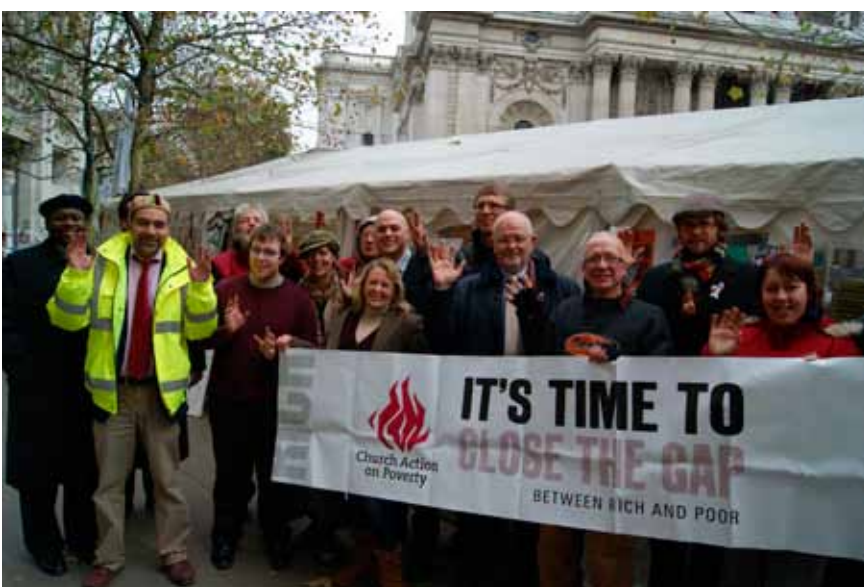
Church leaders express support for protesters against austerity