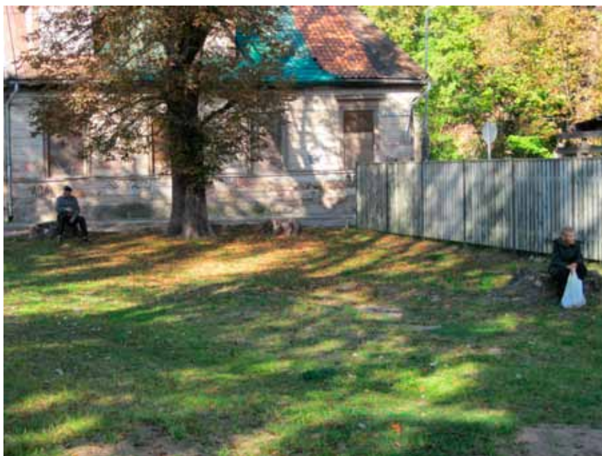
Work migration from Latvia leaves behind abandoned homes and the older generation.

Allow each participant in the group to speak about his or her experiences. If there is only time for two or three people to tell their stories at one session, continue next time. There’s no need to rush. It is important to hear each participant’s story. It is critical that participants speak about their own personal experiences, not offer the official media version regarding austerity. For this to happen there needs to be trust among the group members. There may be hurtful experiences to talk about. Perhaps a family member has had to travel to another country to earn a living. Or maybe someone has had to sacrifice their flat because of debts. After stories have been shared, other group members may ask questions without getting in a discussion or proposing solutions to questions that haven’t been asked. It is possible to film the stories and include the footage as a part of a wider film project.