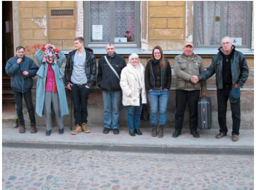
The group "Talks about the Bible and life" at The Congregation of the Cross, Liepaja, Latvia.

Make a modern film version of the parable of the unmerciful servant.