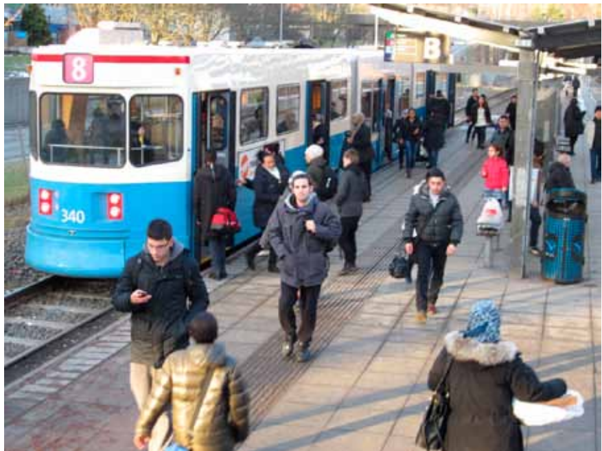
Put on your “Jesus glasses”!