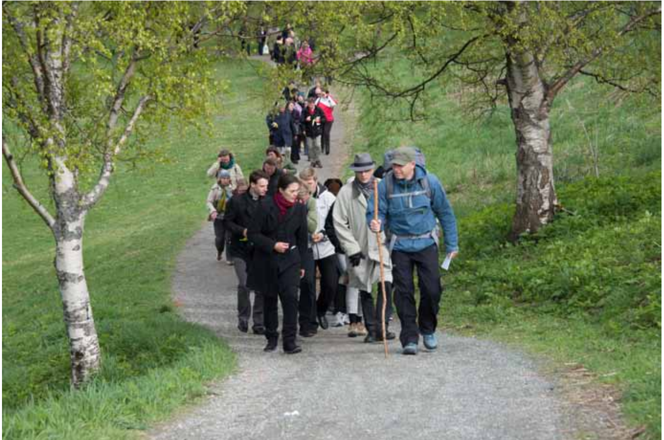
Delegates of the Trondheim Church Leadership Consultation make a 'Climate Justice Pilgrimage' from the Trondheim Free Church to Nidaros Cathedral, Norway, May 13, 2015.