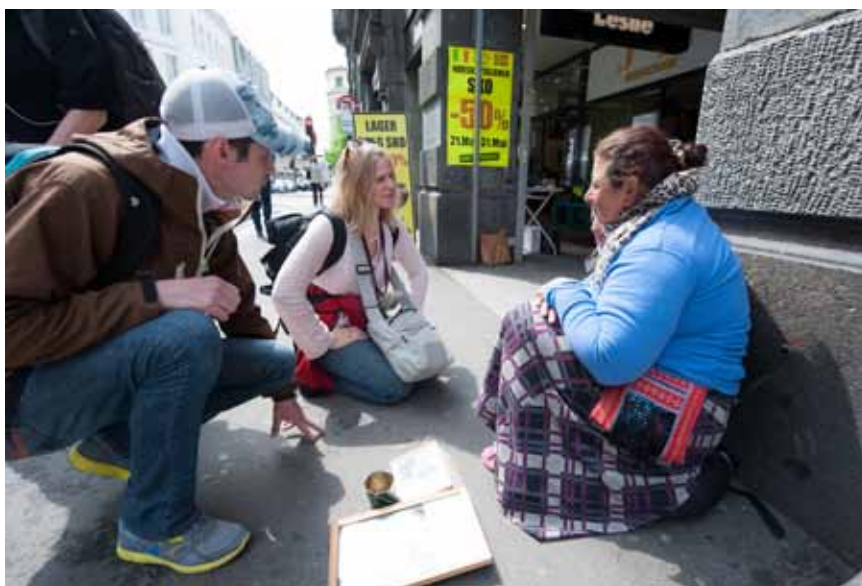
In dialogue with a person asking for support.

Initially, it seems as though the third definition contradicts the first one. At the same time, the first definition is understood as an objective statement, whereas the second very much describes a subjective experience. The third definition could indicate that status can differ from person to person; the first seems to indicate that we as persons are all equal in our worthiness.