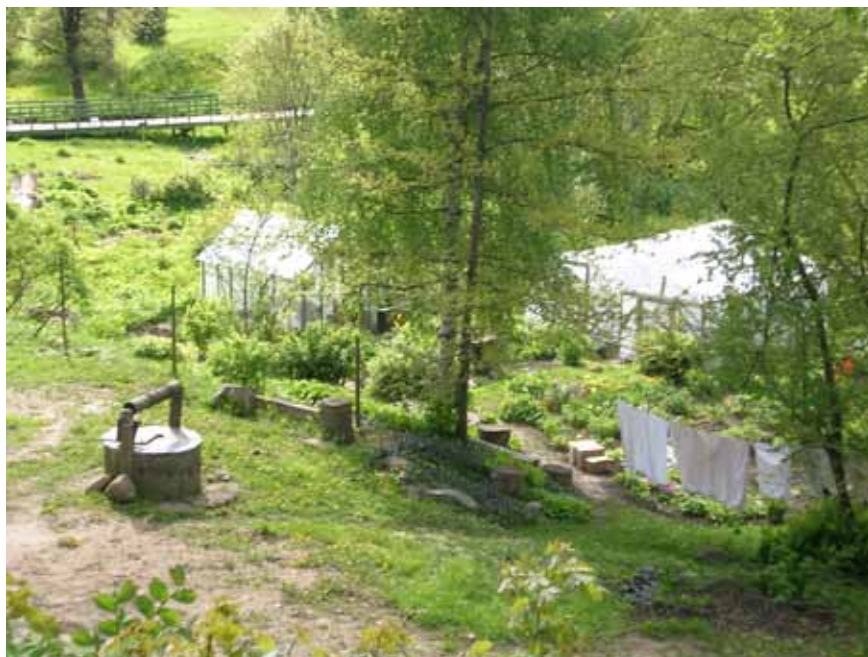
Village scene in Latvia.

What is the background of this text? The formative event in the history of Israel was their release from slavery. The reason for this liberation was not primarily on the grounds of religion. The Israelites were slaves, yes – and