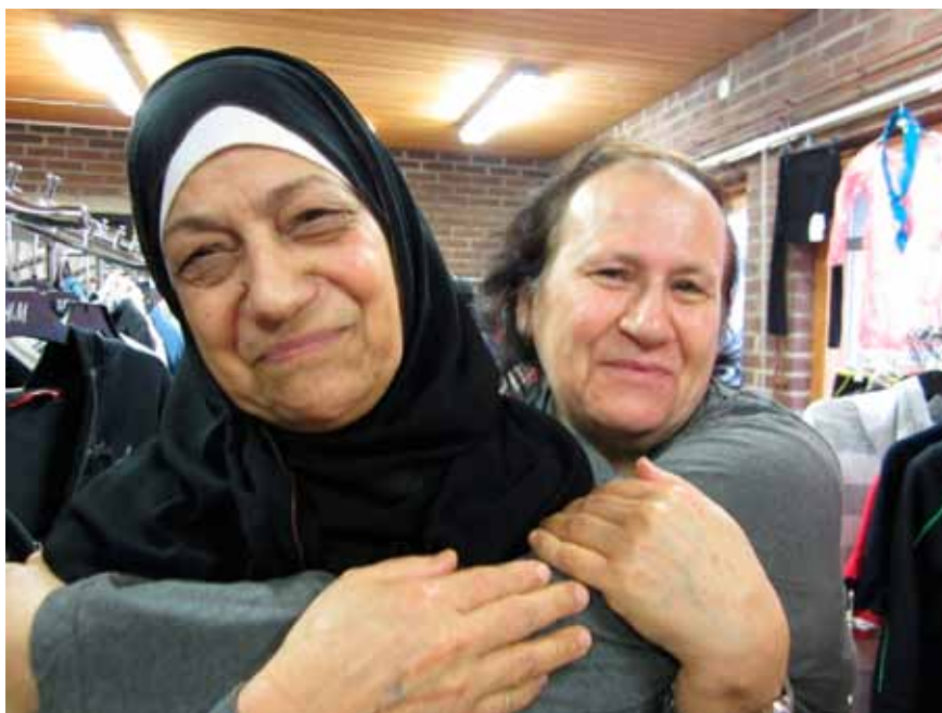
Different faiths and good neighbors in Angered, Sweden.

Portraying a Samaritan in a positive light would have come as a shock to Jesus' audience. Read the text slowly. Try to pretend that you are a member of the majority population and feel the reaction among the people listening to Jesus.