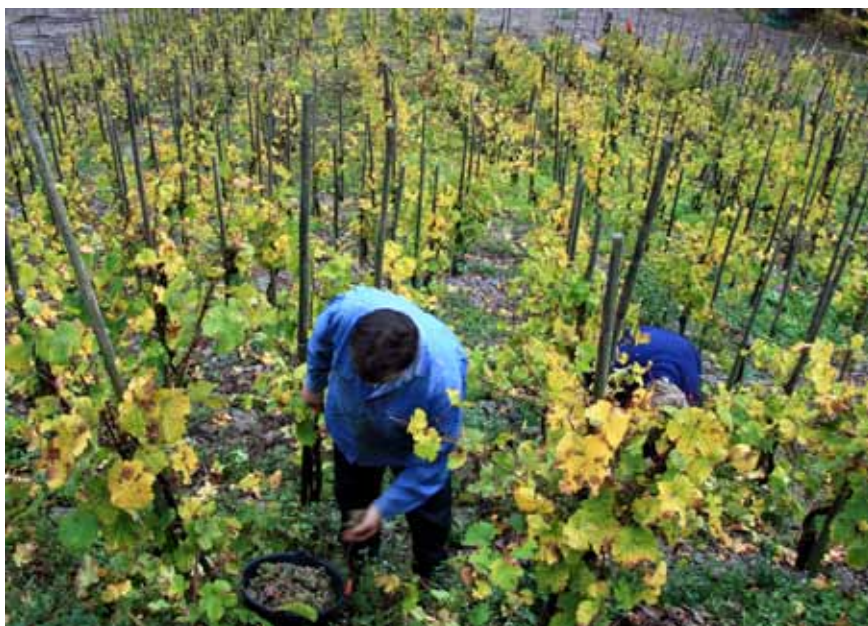
Wine harvest in Moselle.

Work is an essential form of participation in society. Those who do not get work are excluded from society.