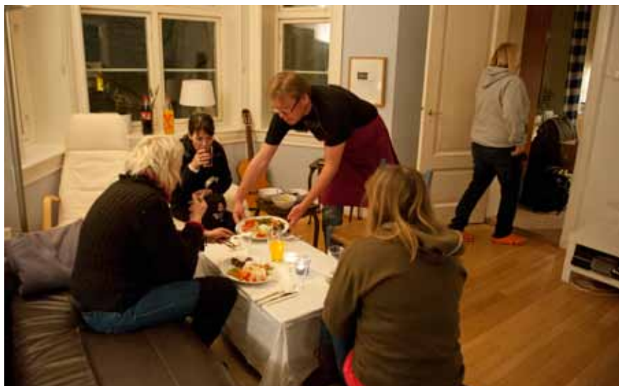
Sharing a meal at the Women's Night Shelter in Oslo.

We are challenged on how we value people: through wealth, intellect, education, position, power, passport or inheritance, etc. Jesus compels us to look again at how we go about judging the value and dignity of different persons. As long as we can rate people differently, according to skills, education, wealth, and so on, we will