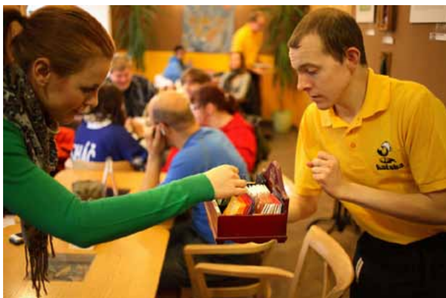
Center of Diaconia ECCB

The Solidarity Group concluded that there is a need for developing policies for funding community diakonia which take a longer term view and